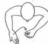
Flat hand, palm down, covers top of other fist